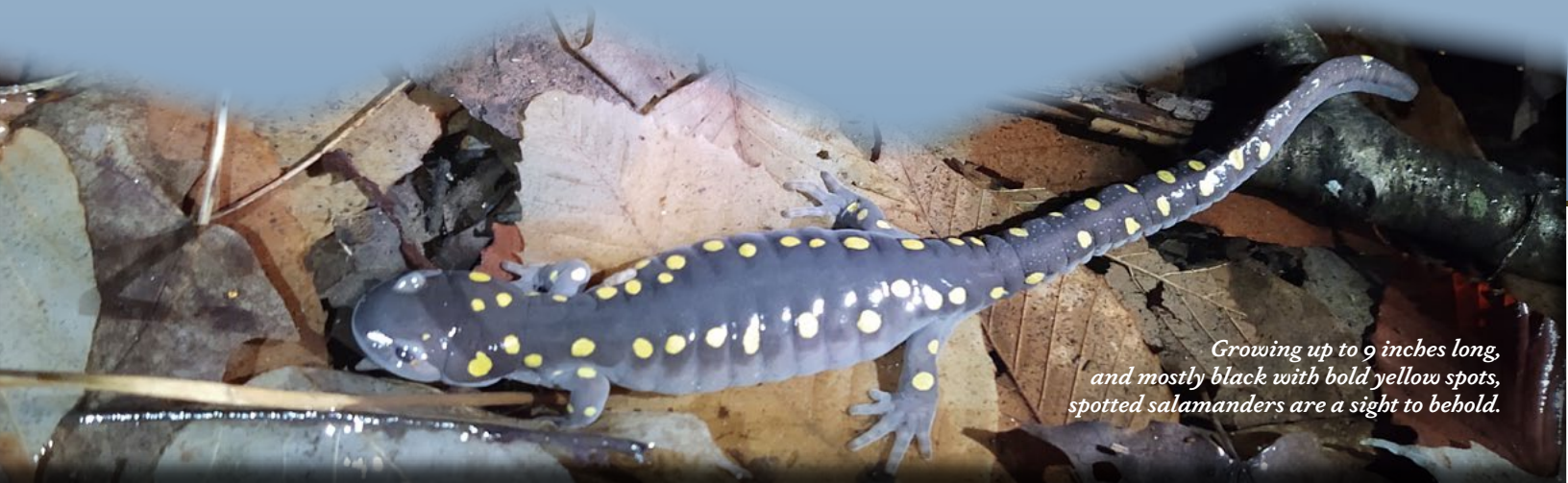
Growing up to 9 inches long, and mostly black with bold yellow spots, spotted salamanders are a sight to behold.