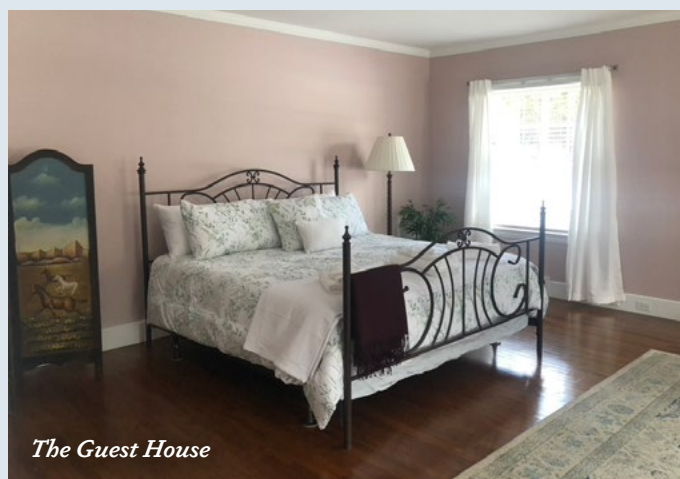
The Guest House